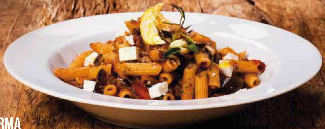
PENNE À LA NORMA

Pick your sauce from: white, sugo (red), four cheese or Bolognese