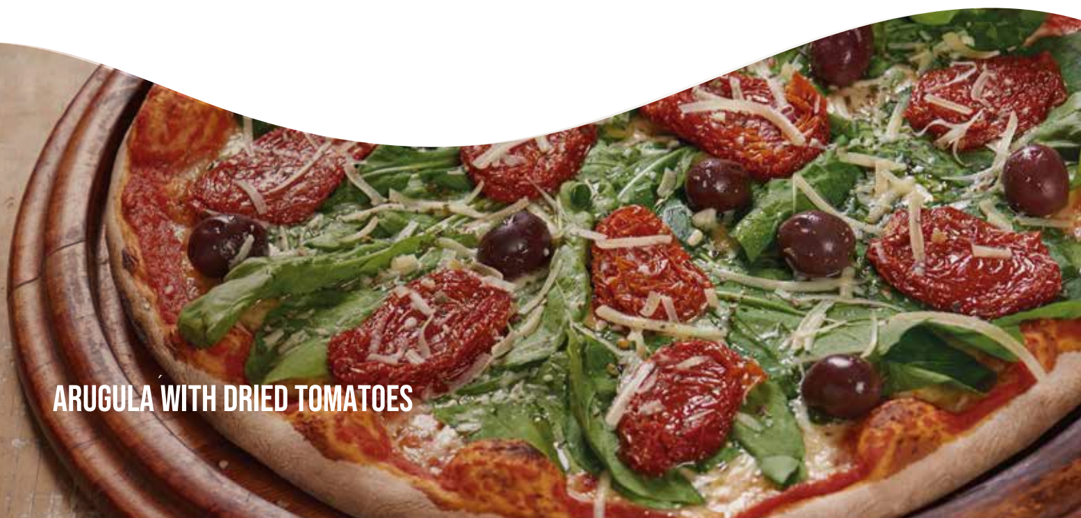
ARUGULA WITH DRIED TOMATOES